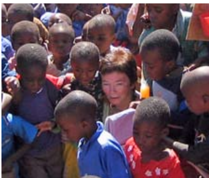
The Dean lost in the crowd.