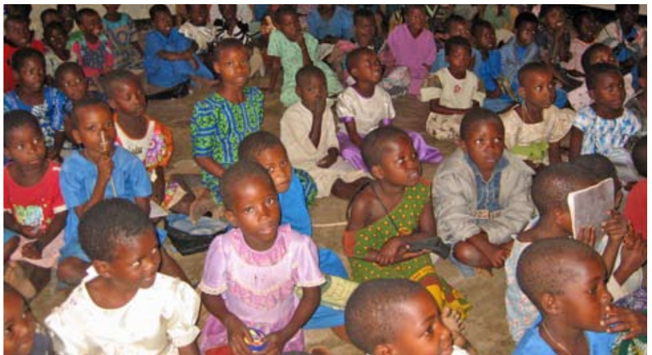
Grade 1 class in Pirimiti Girls Primary School, Malawi motivated and content in spite of having no desks, chairs or books.